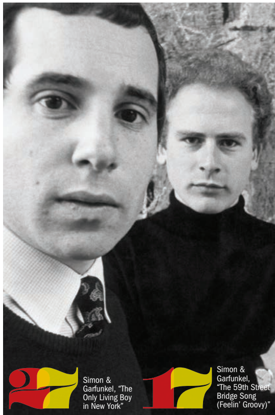
27 Simon & Garfunkel, "The Only Living Boy in New York"

This sinister, piano-driven track introduced the world to the studied, Dickensian style of street reportage that would become Nas's trademark, all but transporting listeners to the street corners of his native Queensbridge, while offering one of the rap legend's most famed lines: "I never sleep 'cause sleep is the cousin of death."— JS