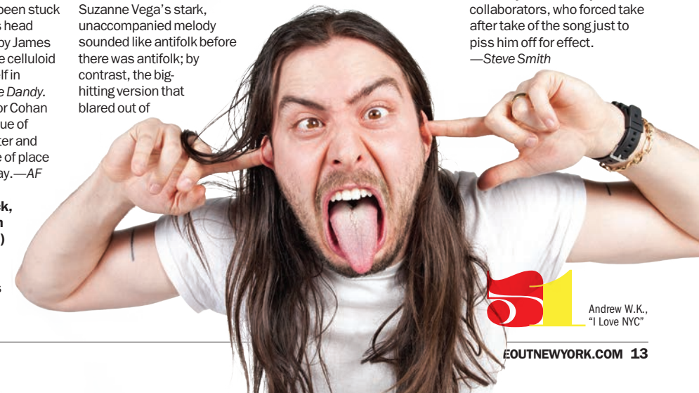
Andrew W.K., “I Love NYC”