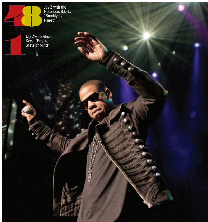
48 Jay-Z with the Notorious B.I.G., "Brooklyn's Finest"

Modern-day balladeer Ryan Adams shot the devastatingly gorgeous video for this New York City hymn of praise against a backdrop that would change forever just four days later, when the Twin Towers were destroyed. The